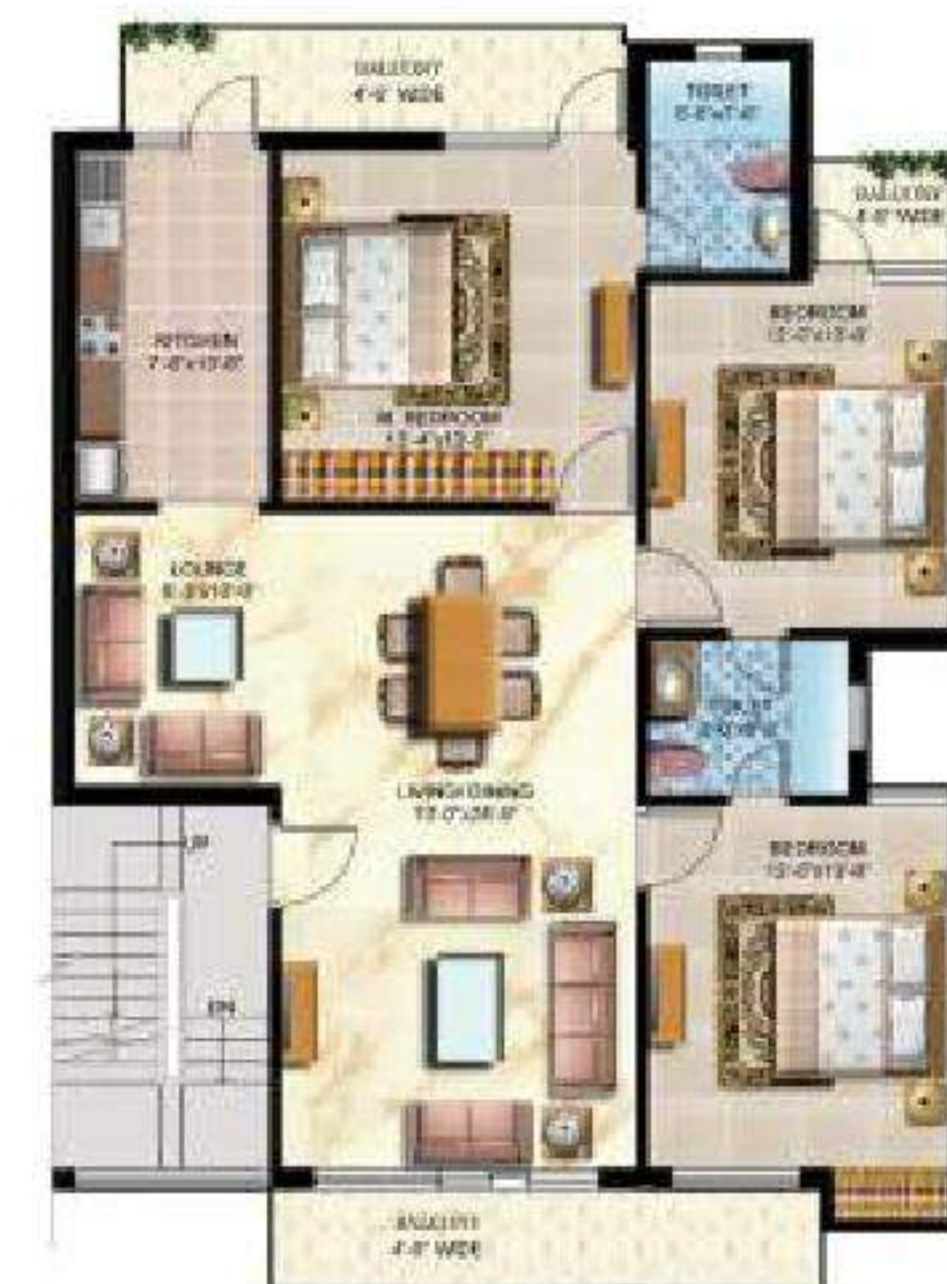
FIRST & SECOND FLOOR PLAN

PLOT SIZE : 10.5 Mt. x 24.18 Mt. SALEABLE AREA 1640 SQFT PLOT NO. 579K, 246K, 246J, 246A 579H, 446A, 446D, 246V, 424, 412, 278L