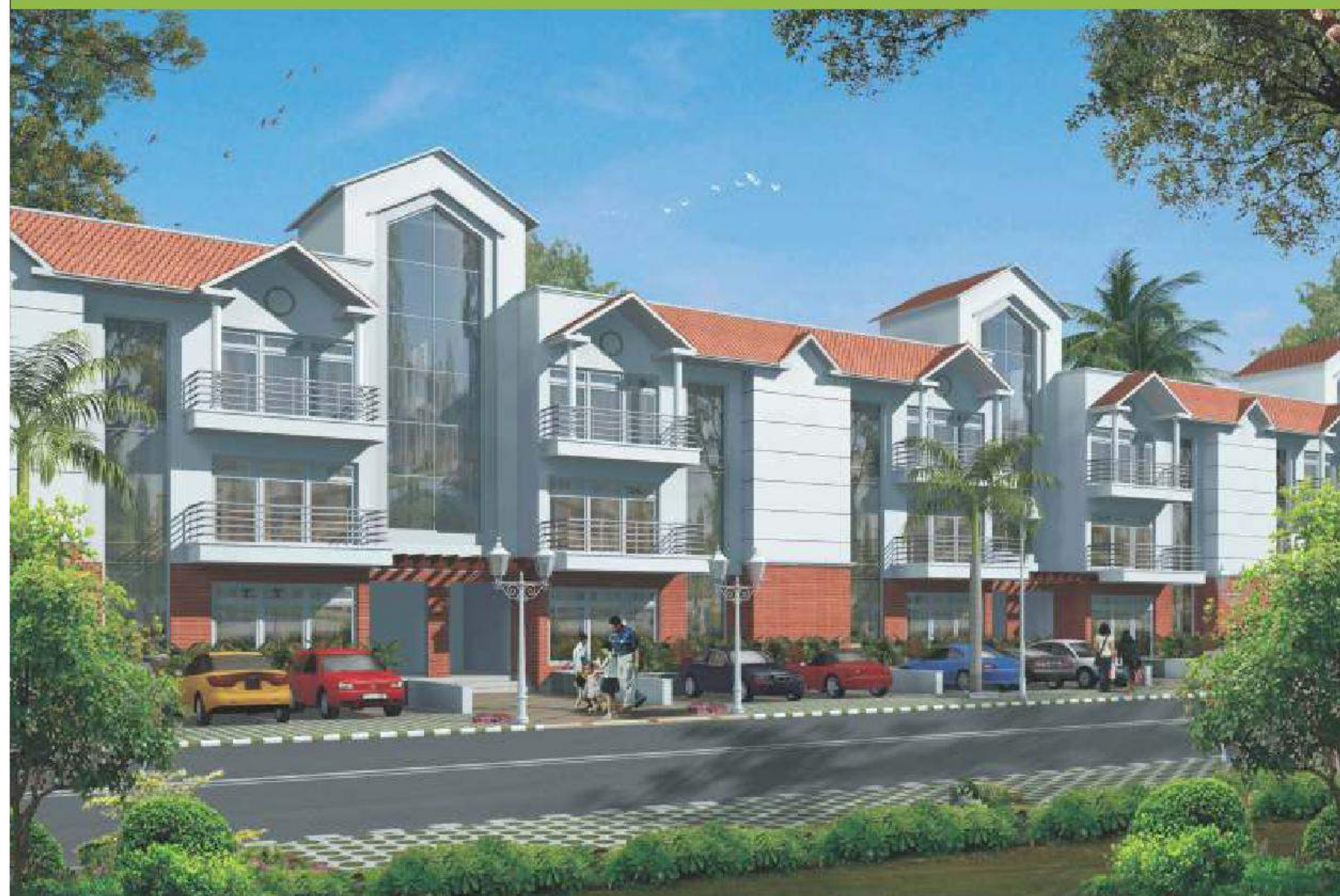
Perspective view of 1180 & 1640 sq. ft. (G+2 Floor)

Dreams are never restricted to dimensions because they always have the scope to turn out even bigger than what you have imagined. That's why Omaxe New Chandigarh presents Silver Birch.