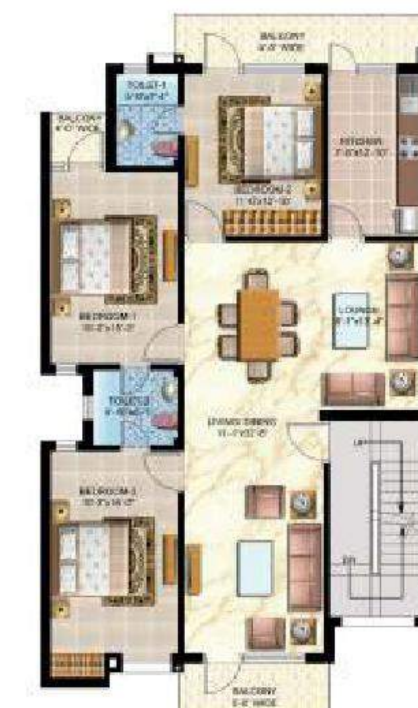
FIRST & SECOND FLOOR PLAN

PLOT SIZE : 9.2 Mt. x 27.5346 Mt. SALEABLE AREA 1640 SQFT PLOT NO. 268, 273, 267, 274C, 277, 274B