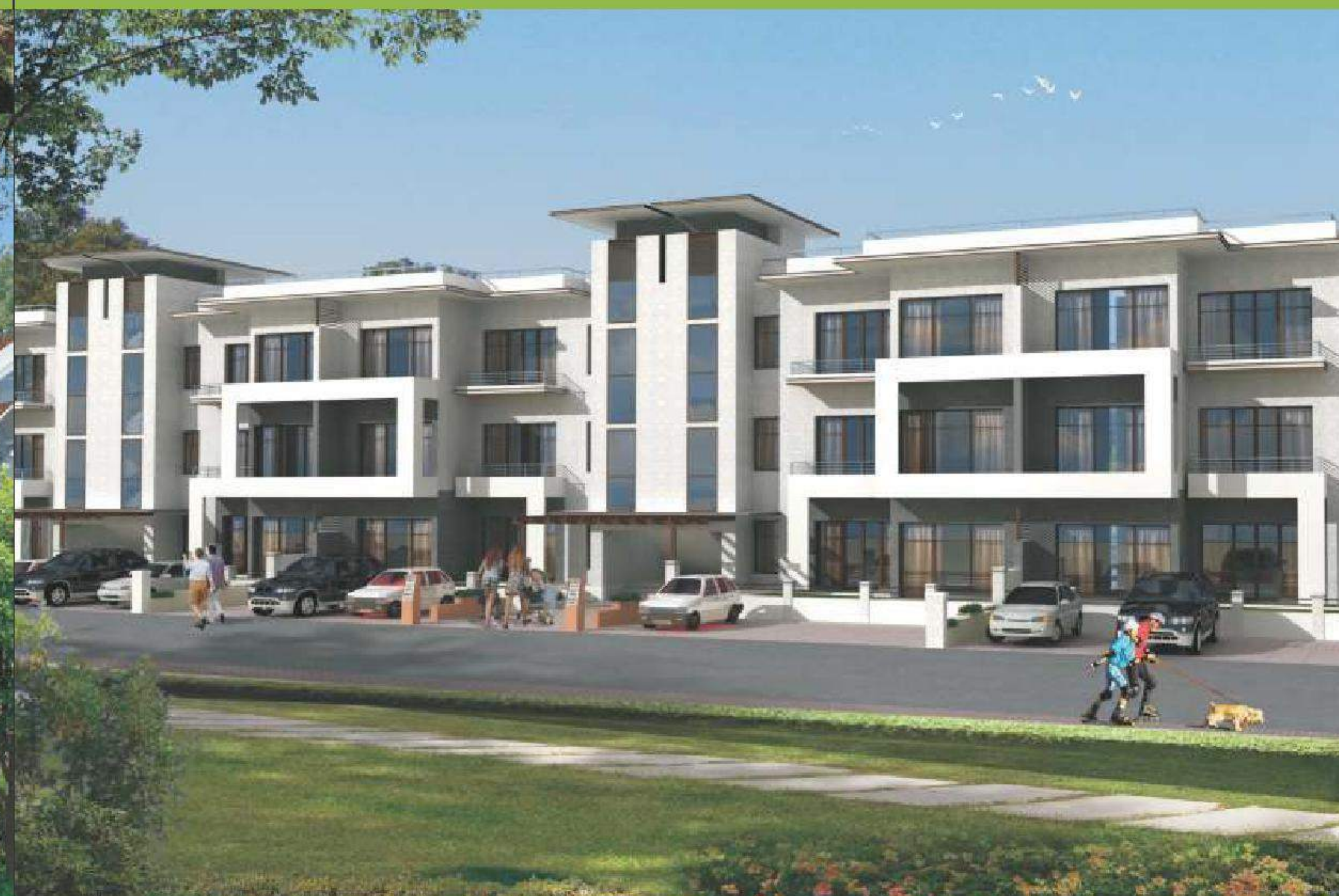
Perspective view of 2140 sq. ft. (G+2 Floor)

A lifestyle even bigger than your dreams, Silver Birch doesn't just realize your dream home but your dream environment.