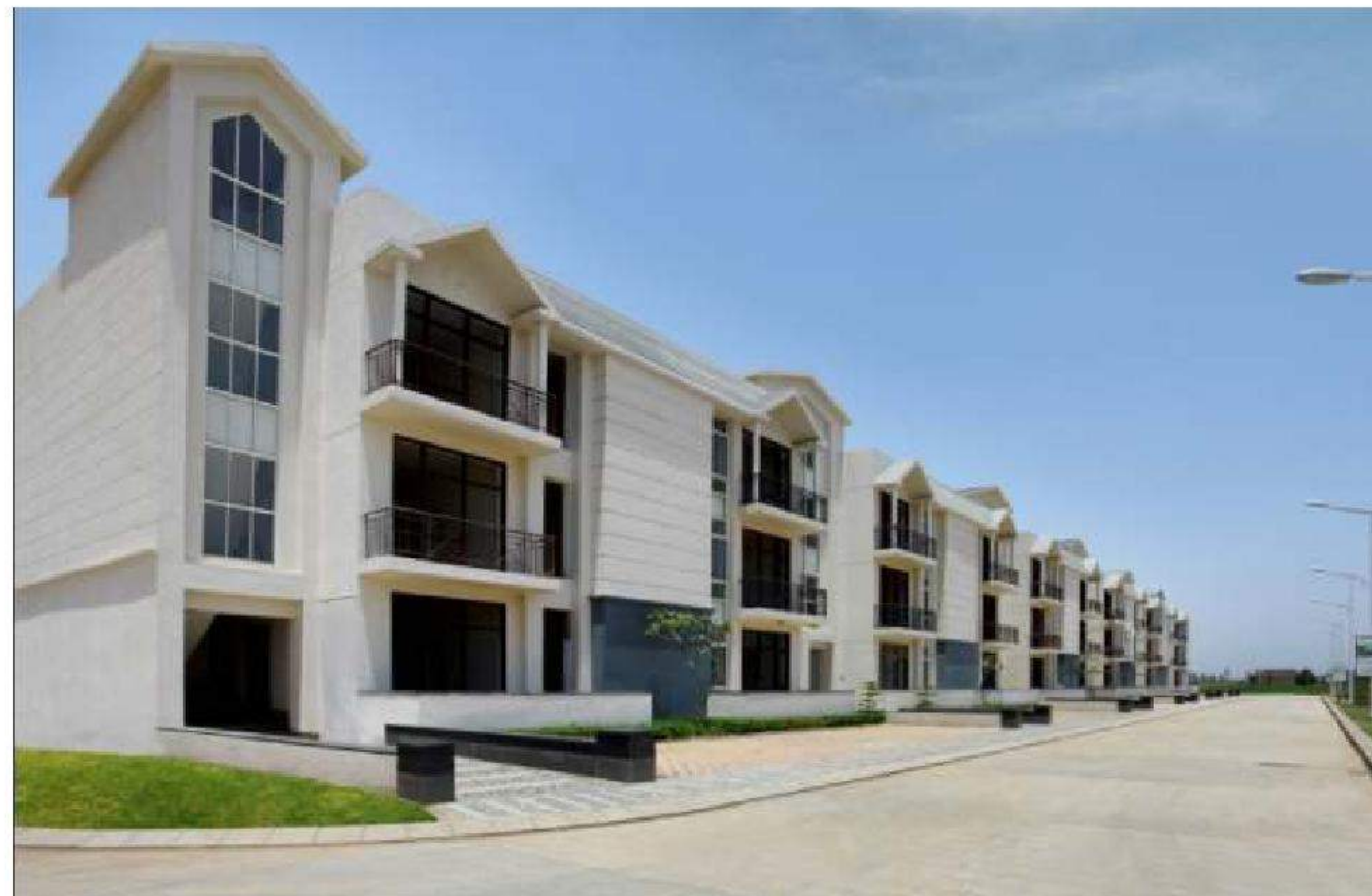
Actual Photograph of 1180 & 1640 sq. ft. (G+2 Floor)