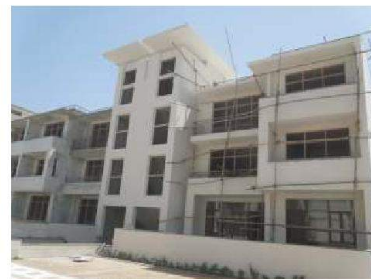
Actual Photographs of 2140 sq. ft. (G+2 Floor)